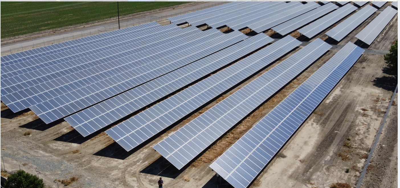
The IO Cleantect system was installed on 1.5 rows of panels on the bottom right.