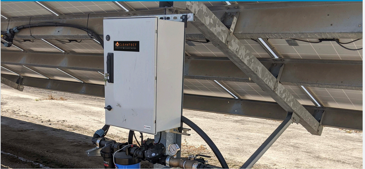
The IO control system and electrolysis system hooked up to the 1" valve and 120V outlet provided by the Leyendekkers.

The Leyendekkers set up a 1" female valve and a 120V outlet next to the PILOT location and the Instant ON Cleantect system was installed in one day.