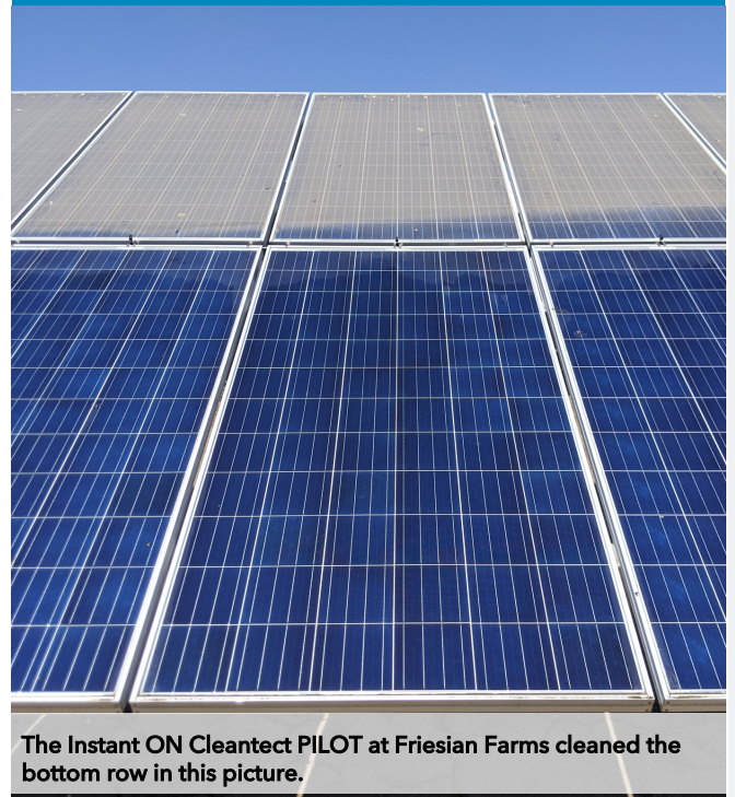
The Instant ON Cleantect PILOT at Friesian Farms cleaned the bottom row in this picture.

until non-IO Cleantect panels were brush-cleaned.