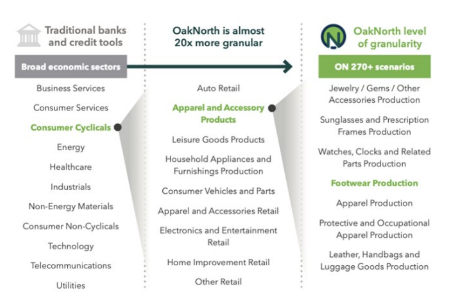
Figure 5: ON Suite Sectors and Subsectors

The ON Credit Intelligence Suite categorizes borrowers into 1,600 granular subsectors and applies one of 262 domain-specific models to the business that is specific to a cluster of subsectors. For example, the Consumer Cyclicals sector breaks down into several subsectors, such as auto retail, home improvement retail, and apparel and accessory products. The ON software breaks out subsectors further into several "scenarios," as depicted in Figure 5.