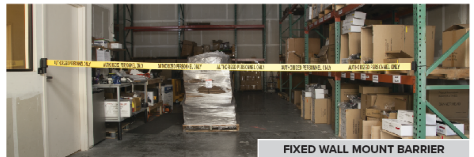
FIXED WALL MOUNT BARRIER