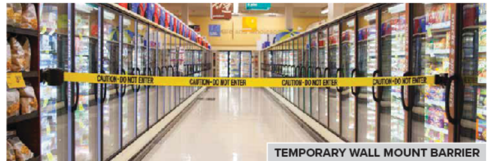
TEMPORARY WALL MOUNT BARRIER

Our Plus Line Barrier System is an effective, reusable and portable barricade system. The cart provides easy mobility and quick assembly and breakdown of the barrier. The industrial-strength cart can hold five 15' retractable belts, five stanchions and five bases.