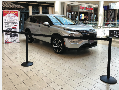
SINGLE BELT OPTION