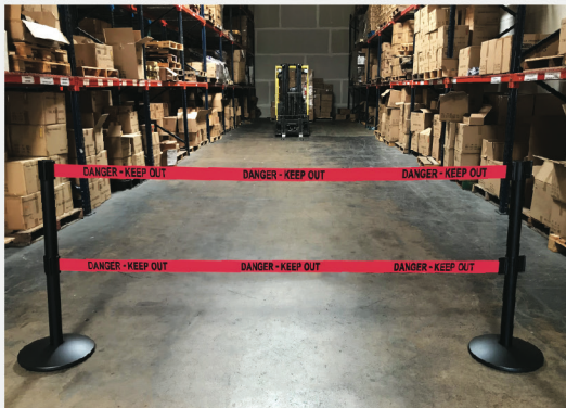
DUAL BELT OPTION