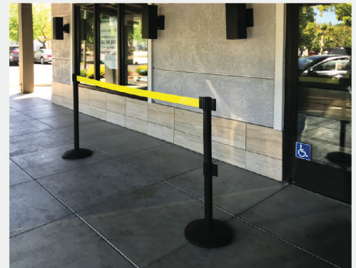
INDOOR OUTDOOR USE