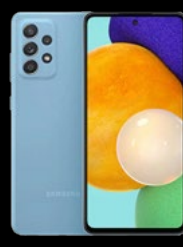
Galaxy A52 5G