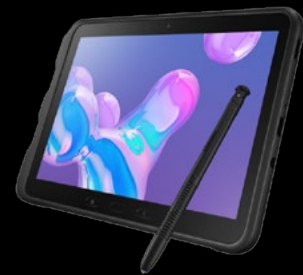
Galaxy Tab Active Pro