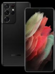
Galaxy S21 Ultra