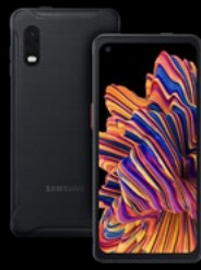
Galaxy XCover Pro