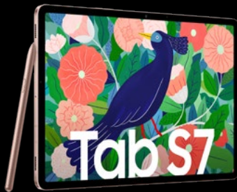
Galaxy Tab S7