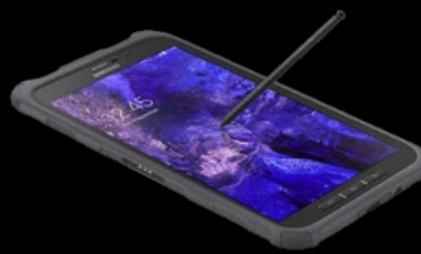
Galaxy Tab Active3