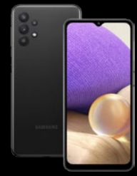
Galaxy A32 5G