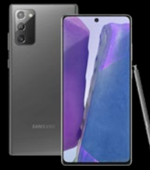
Galaxy Note20 5G