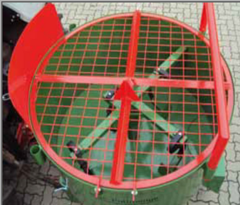
Mixing paddles on DBM750