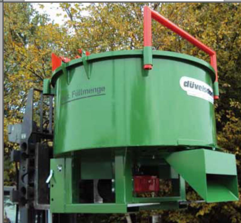
DBM750 on forks