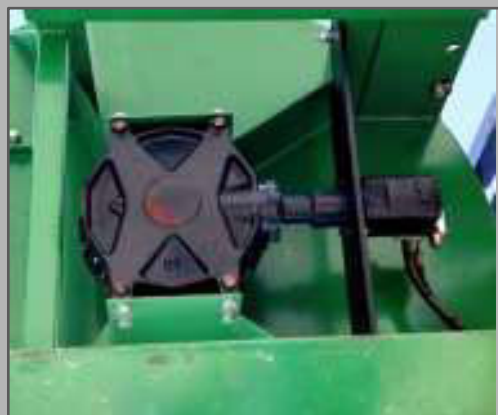
Optional hydraulic drive