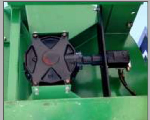
Optional hydraulic drive