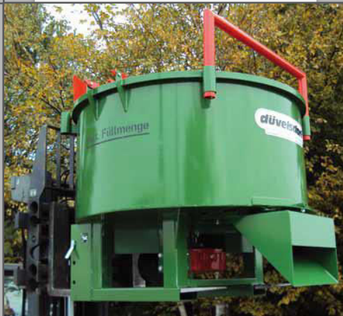
DBM1250 on forks