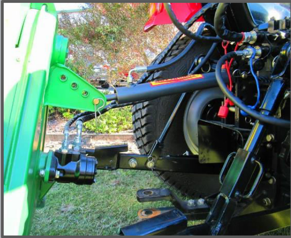
Hydraulic Top Link