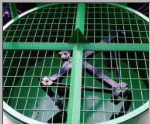
Mixing paddles on DBM750