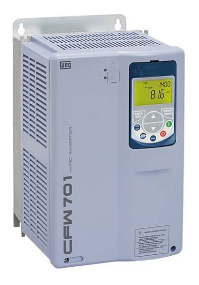
Figure 4: NEMA 1 rated VFD with open slats for ventilation

NEMA1 and NEMA12 rated enclosures are not required to be air tight, and typically inexpensive fans are used to blow the surrounding air through the VFD and carry the heat away to the surroundings. Provided the surrounding air is not above 30C-40C, utilizing convection is the most effective means to dissipating large amounts of heat. As a result, NEMA1 and NEMA12 VFD's are the most cost effective design particularly for VFD's rated 30amps and above.