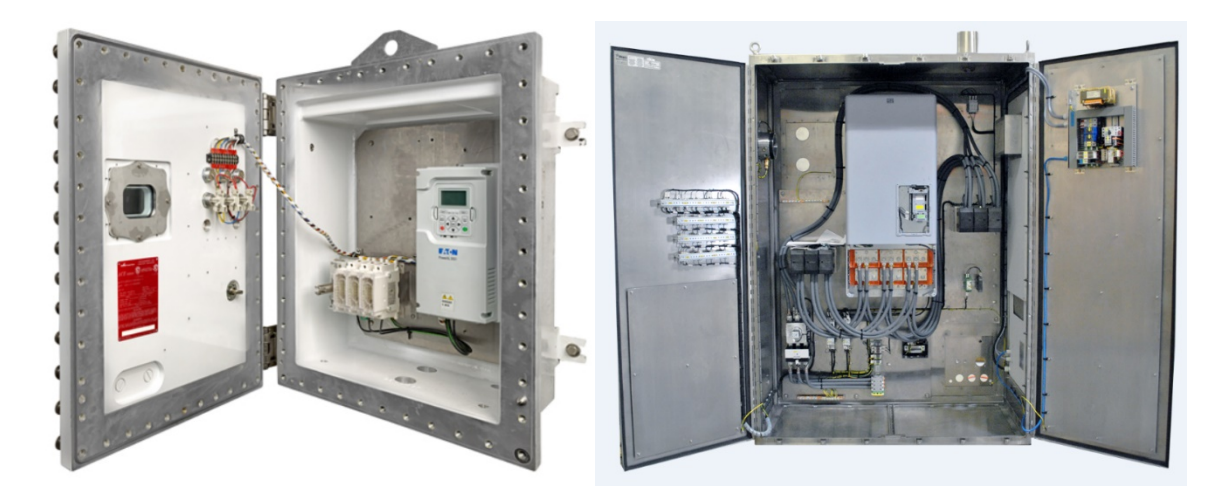
Figure 6: NEMA 7 Enclosure containing VFD, NEMA4 Air Purge Panel

An alternate solution is to pressurize a NEMA4 rated enclosure with a nonexplosive gas, typically compressed air. This ensures that no explosive gases will enter the enclosure. This solution may be more cost effective than a NEMA7 rated enclosure, but needs to include a pressure switch to verify positive pressure is maintained in the enclosure and a means to automatically power down the VFD if the air pressure is not maintained. Typically it is more cost effective and safer to simply install the VFD outside the classified area.