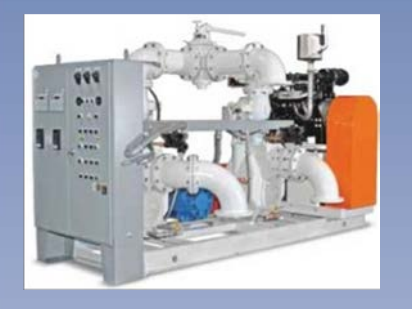
Variable Speed Pressure Boost