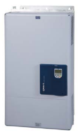
Figure 5: NEMA4X rated VFD, and Custom NEMA 4 enclosure with NEMA 1 VFD (NEMA4 keypad).

NEMA 7 (explosion proof) enclosures can be used if a VFD needs to be installed in a classified area containing explosive gases or dust. The term explosion proof is somewhat misleading. The thick walls of an explosion proof enclosure do not prevent an explosion, rather they contain the explosion within the enclosure. If gasses enter the enclosure through failed conduit seals or other means the VFD can cause an explosion inside and will be destroyed, but the flames will not reach the outside atmosphere and cause a larger explosion. Explosion containing enclosure may be a more suitable term for NEMA7 rated enclosures.