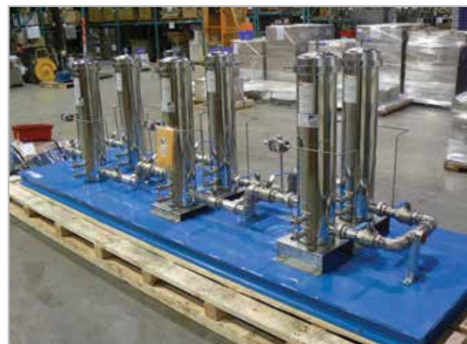
3-Stage Filtration System Designed for Cooling Tower Water