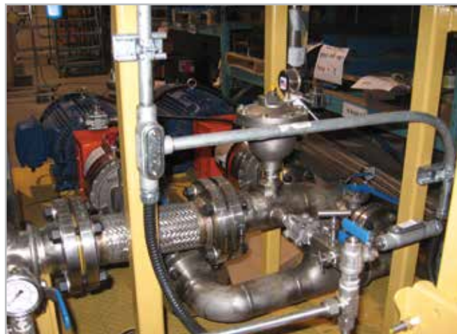
Gas Cooling Skid Designed with Closed-Loop Control