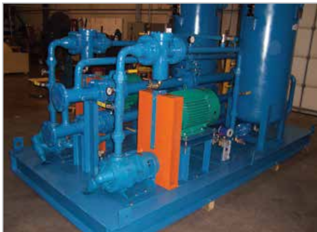
Diesel Fuel Pump and Two-Stage Coalescer/Separator Skid Designed for Diesel Engine/Generator in the Mining Industry to measure and remove moisture from Diesel Fuel