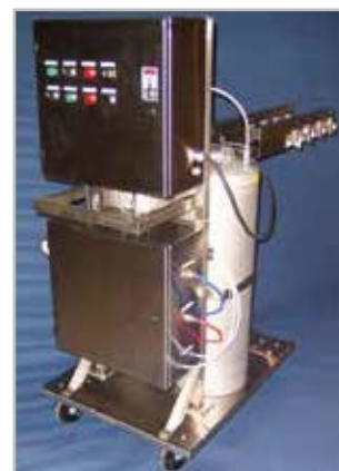
Pan Coating System Food Industry