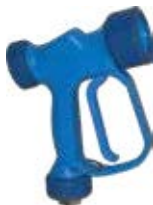
Wash Down Spray Gun