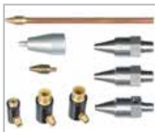
Compressed Air Nozzles