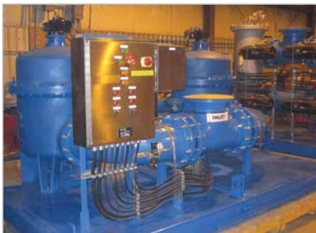
Duplex Automatic Strainer Skid Designed for Pre and Post Water Filtration