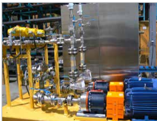
Gas Conditioning System Oil & Gas Industry