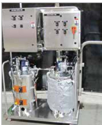
Automated Glazing System Bakery Industry