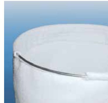
SNAP-RING seal ring