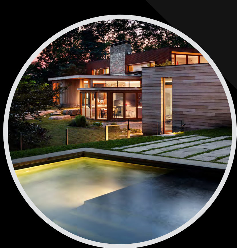
Pools & Spas