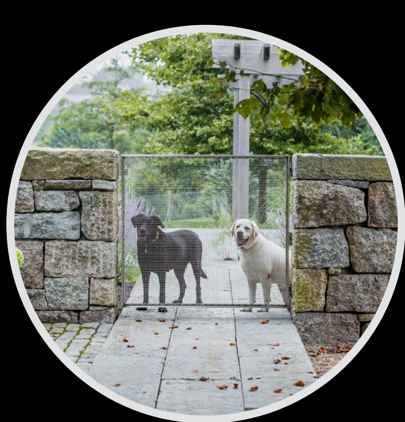
Gates & Structures