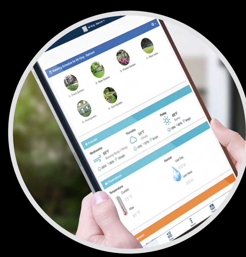
Systems & Controls