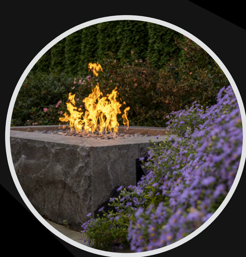
Kitchens & Fire Features