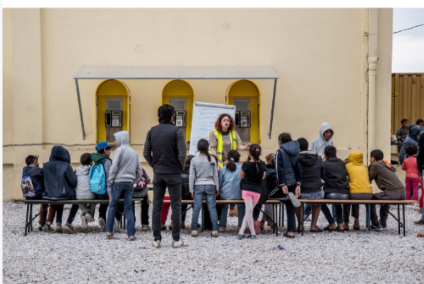
Organization Humanity Crew, an international aid organization that provides first-response mental health interventions and psychological aid to refugees

There are more ways than ever to get involved with Social Impact and support a cause you care about!