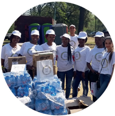
Marketing and sales