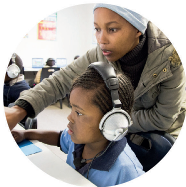
Early childhood development