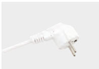
POWER CORD length 2 m