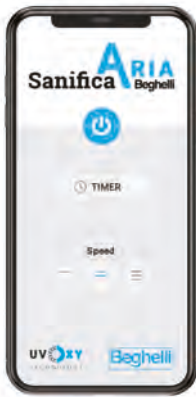
APP for local control (via bluetooth)

SanificaAria 200 connect can be managed locally or by means of a simplified APP that turns your smartphone into a remote control. In the connect version, by using the APP dom-e Beghelli, the user can control all the functions of the air purification system remotely.