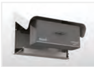
SANITIZING CARTRIDGE uvOxy 200 With built-in protection filter and UV-C flow cell Item 26721