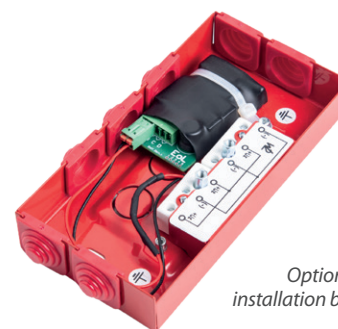
Optional installation box

ABT-S106** / ABT-S136** / ABT-S186** / ABT-S206 / ABT-S206B / ABT-S2010 / ABT-W6 / ABT-W6W / ABT-W6/AB / ABT-LA30/60 / MCR-SMSP20 / ABT-P10 / ABT-P20