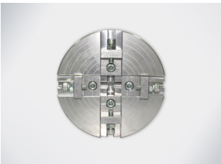
Welding neck support