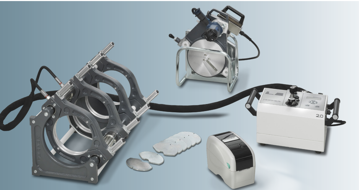
Stand-alone in Butt-Welding