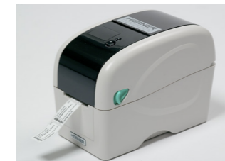
Tag printer and label tags

The HÜRNER movement pushbutton fitted to the basic machine chassis allows moving the machine carriage when the welder stands next to the chassis. This enables convenient welding without constant back-and-forth between the hydraulic and control box and the machine chassis.