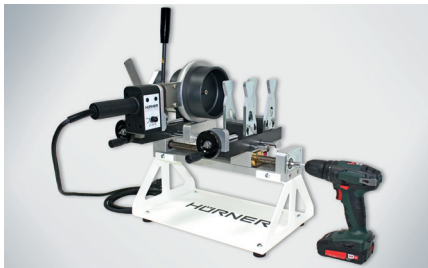
Power tool (drill / cordless screwdriver) optional