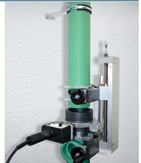
Vertical socket welding