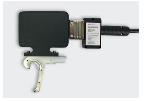
Electr. controlled heating element The electronically controlled, PTFE-coated heating element features an integrated temperature control.