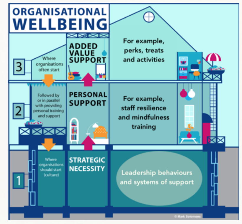
The House of Organisational Wellbeing

Yet many more schools spend time on building the middle and top floors first. They provide wellbeing days, treats, such as breakfast or cakes at meetings, or organise activities like yoga as the focus for their solution.