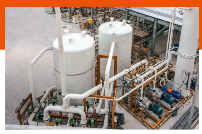
Zeeco Vapor Recovery Unit