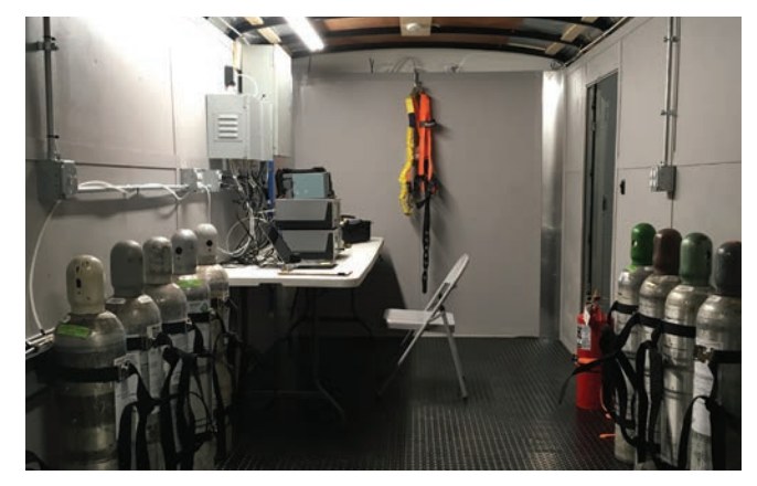
Mobile Test Lab