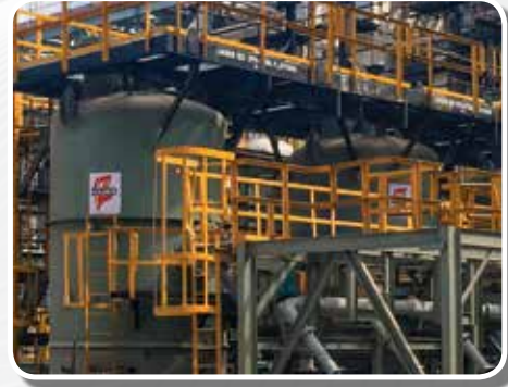
Vapor Recovery Unit

Let Zeeco help you operate smarter. Give us a call today and let's start talking about the right vapor recovery solution for your terminal.