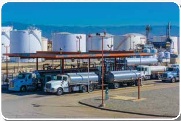
Truck Loading Terminal

Zeeco's Vapor Recovery Systems minimize emissions from the loading of trucks, ships, barges, and tanks, and return these valuable vapors to the loading or storage operation. Vapor recovery systems significantly reduce the loss of profitable products with recovery efficiencies up to 99%-plus and recovery rates between 1 to 2 liters per 1,000 liters loaded. In many applications, return on investment can occur within a few short years.