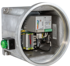
048-371-1112 model shown