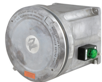
048-371-1112 model shown