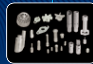
PARTS & SERVICE