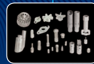
PARTS & SERVICE