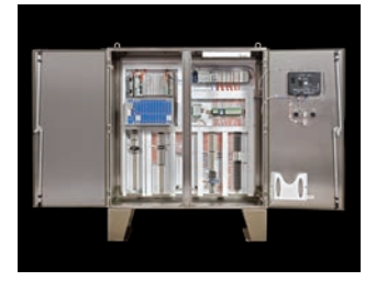
Burner Management System