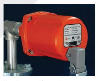
ProFlame+ Flame Scanner