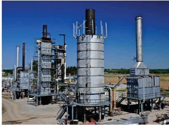
Zeeco's global headquarters houses office, manufacturing, and research and testing facilities all on a debt-free 250 acre (1 km2) campus near Tulsa, Oklahoma, USA