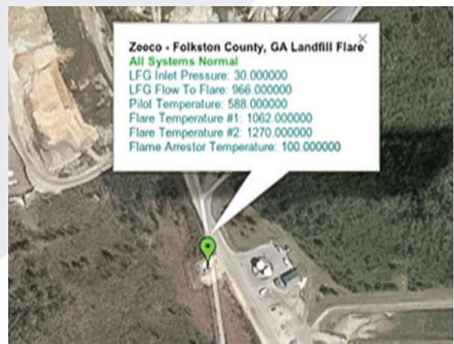
ZEECO® Guardian Google Maps Interface

Managing multiple landfill sites is easy with ZEECO Guardian's Google Maps interface and online portal. Guardian's online portal displays a global or domestic map, pinpointing multiple landfill locations and their operational status. Preventative maintenance is tracked automatically, so you know exactly which flare is due for service. Flare documentation, drawings, and OEM manuals can be stored on the Guardian's cloud for quick, online access.