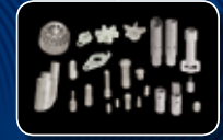
PARTS & SERVICE