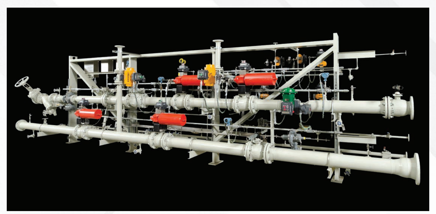
BMS Fuel Skid

BURNERS | FLARES | THERMAL OXIDIZERS | VAPOR CONTROL | RENTALS | AFTERMARKET