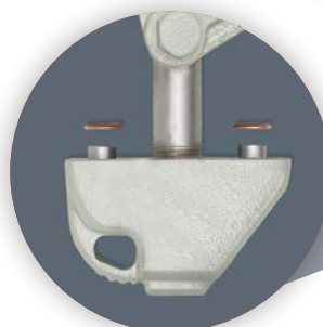
New Sleeve/Gasket Location