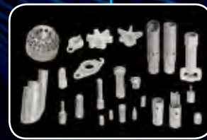
PARTS & SERVICE