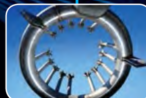
Upper Steam Ring