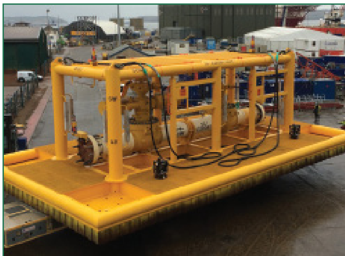
Subsea Isolation Valve (SSIV) prior to offshore deployment

With subsea construction completed, the newly made-up flange joints were locally leak-tested at each gasket to provide initial confirmation of the joint integrity. This then allowed the pipeline pressure to be equalised behind the isolating Tecno Plug and the seals and locks were actively unset.