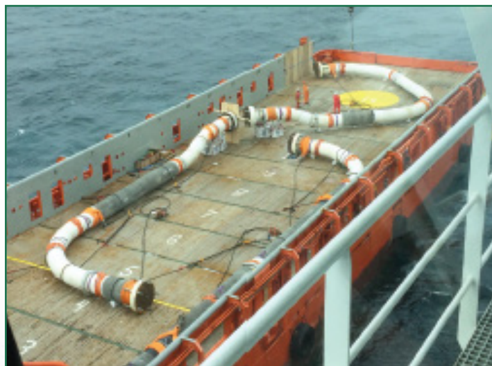
36" metrology spools used to tie-in SSIV

The rear Tecno Plug was then remotely operated to hydraulically set the seals and locks; once the barrier was proven, a successful re-instatement leak test of the newly installed SSIV was then conducted by raising the pipeline pressure from the platform launcher to 158 bar against the leak test Tecno Plug.