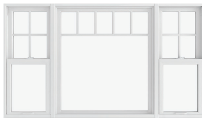
STANDARD COTTAGE STANDARD RECTANGULAR ONE-HIGH RECTANGULAR