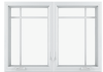
PRAIRIE FOUR-LITE ONE-HIGH