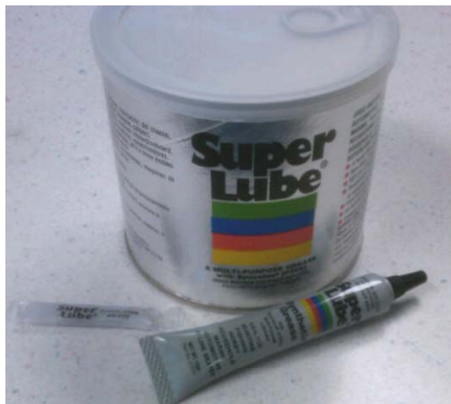
1cc packet, 1/2 oz tube, and 400 gram can.

Also affects 300 series pumps operating below 500psi.