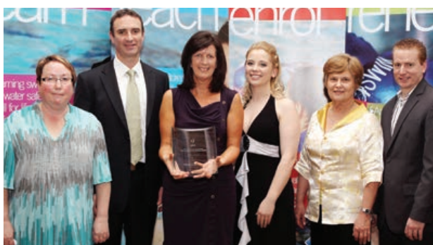
Recognised Swimming & Water Safety School of the Year Award Recipient – Swim & Fitness at the AIS, ACT