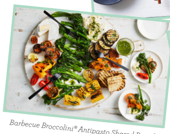
Barbecue Broccolini® Antipasto Shared Board