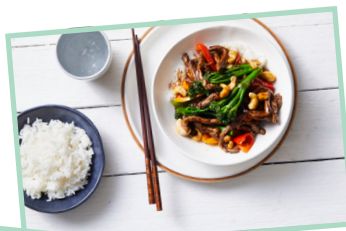
Broccolini® and Teriyaki Beef

For all our unique varieties and recipes visit perfection.com.au