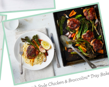
Spanish Style Chicken & Broccolini® Tray Bake