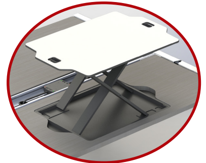
Adjusts from 29" to 44" Holds up to 22 pounds