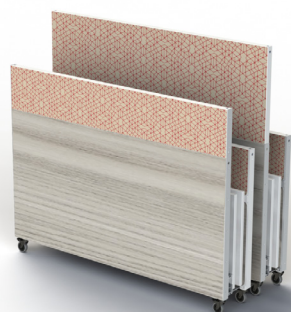
Two Shift stations fully collapsed for easy storage

Add our new Lift to your Solo surface for an easy sit-stand solution