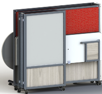
Rendezvous mobile meeting room folded for easy storage

For more information about our products or to schedule a demo visit www.swiftspaceinc.com