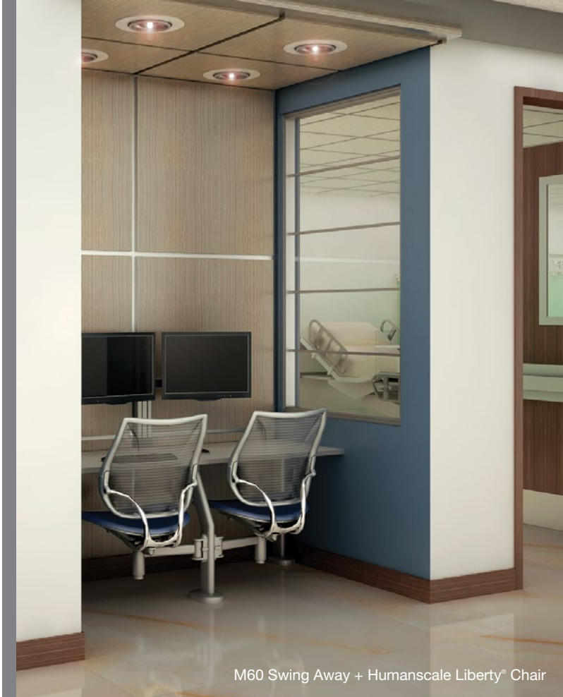
M60 Swing Away + Humanscale Liberty® Chair