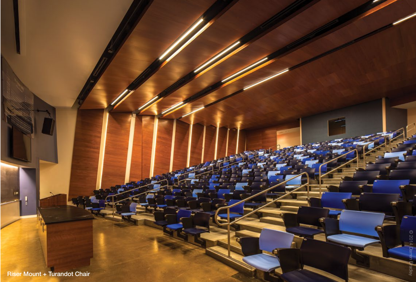
Riser Mount + Turandot Chair