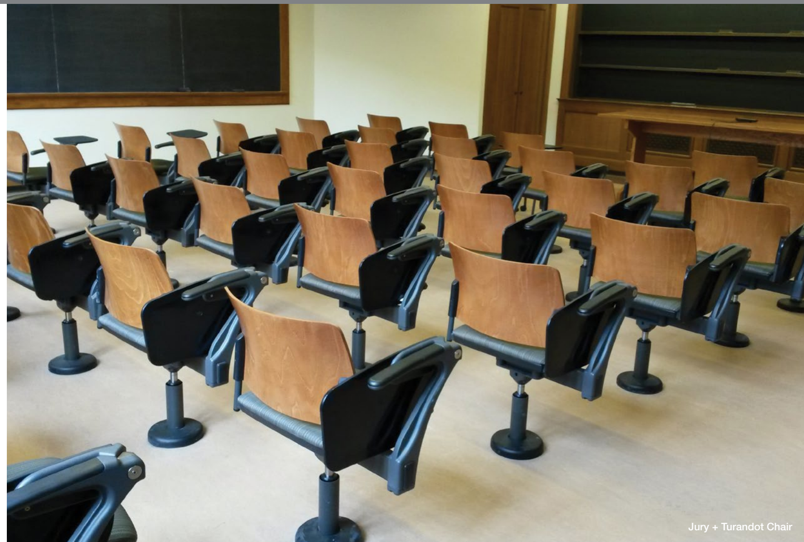
Jury + Turandot Chair