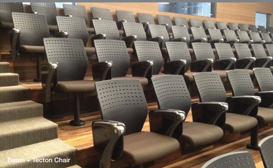
Beam + Tecton Chair