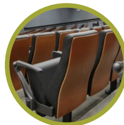
Wood Back Panels