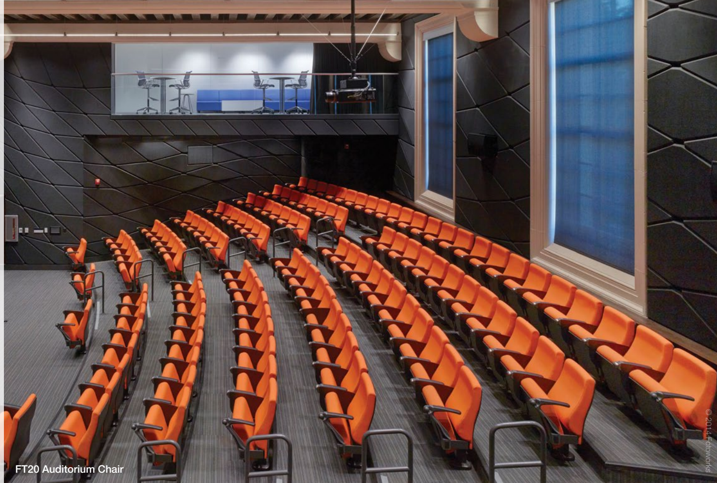
FT20 Auditorium Chair