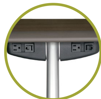
Power, Data & USB Modules

Characterized by its innovative design and outstanding versatility, the M60 is ideal for today's learning environments. Its self-centering seat return delivers room uniformity while the continuous writing surface provides maximum work space. Choose from a variety of surface or under mount power, data and USB modules. Explore the infinite options available with the unrivaled M60 Swing Away.