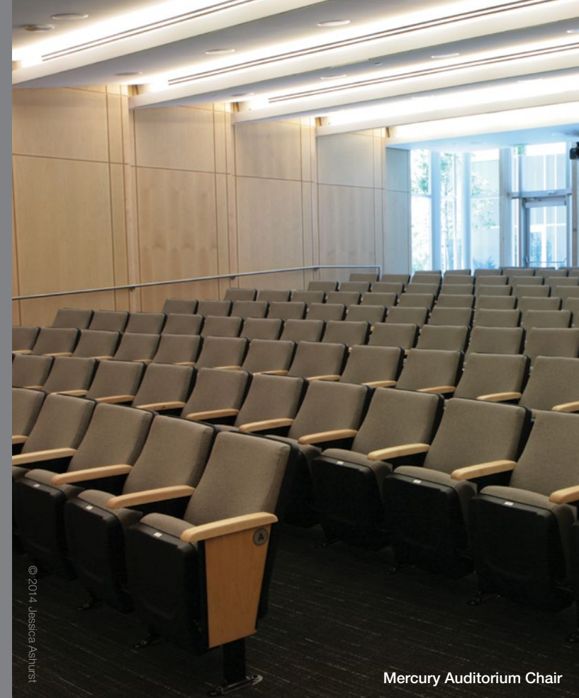
Mercury Auditorium Chair