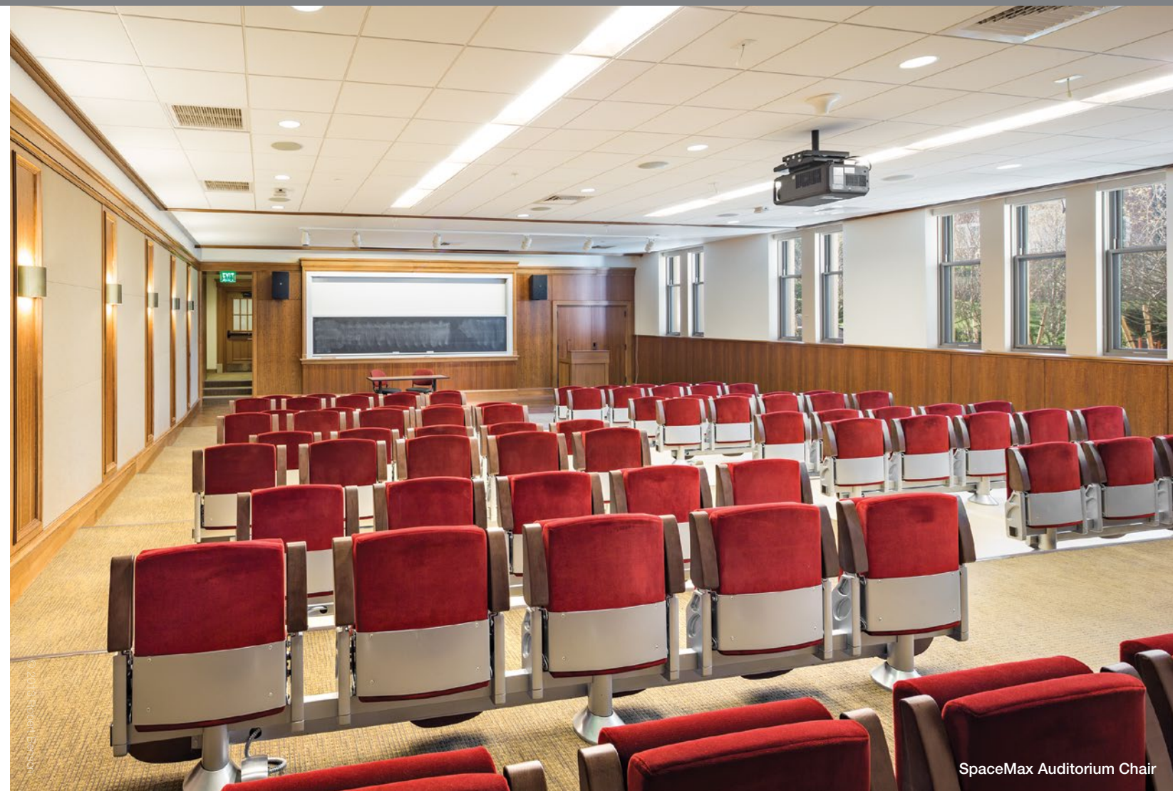
SpaceMax Auditorium Chair