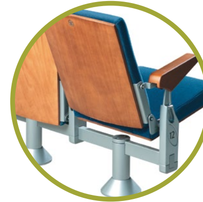
SpaceMax Wood Back Panel

The Mercury delivers both visual appeal and durability at an affordable price. The compact SpaceMax features a silent auto uplift mechanism and folds into a narrow 7" envelope.