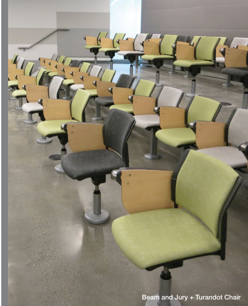
Beam and Jury + Turandot Chair