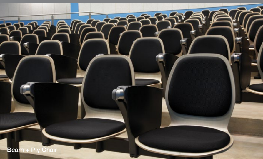
Beam + Ply Chair