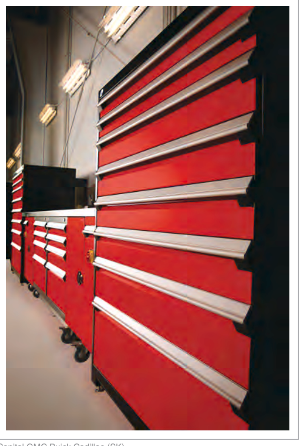
Capital GMC Buick Cadillac (SK)