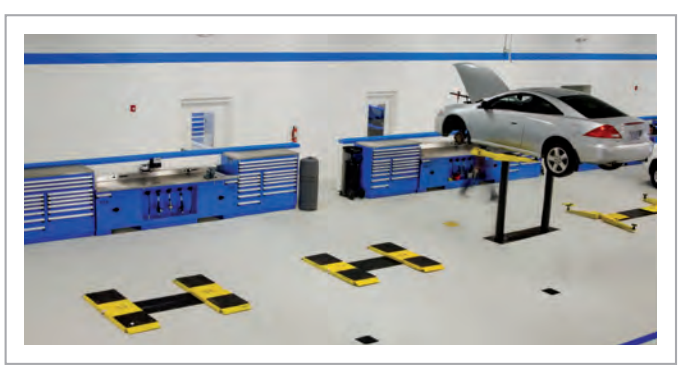
Gerry Wood Honda (NC)