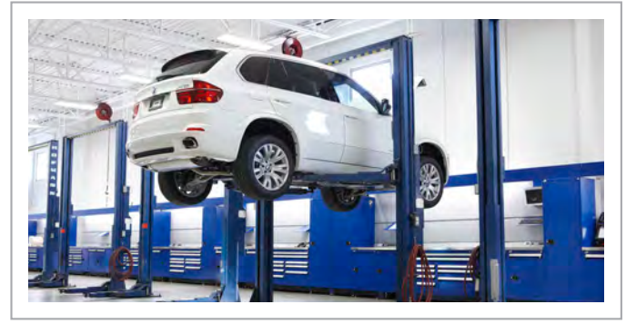
BMW of Mississauga (ON)