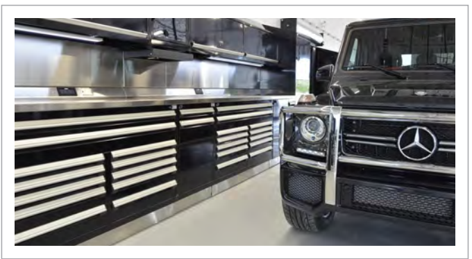
Mercedes-Benz Winnipeg (MB)