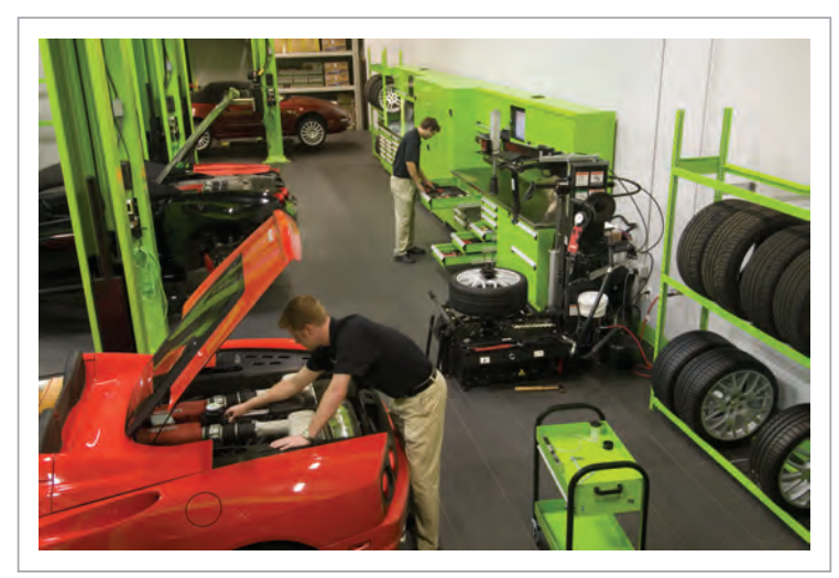
Naples Motorsports (FL)