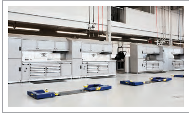
Oxford Dodge Chrysler (ON)