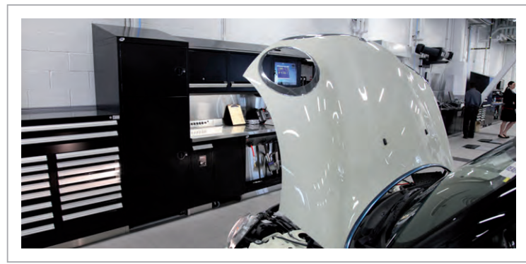
MINI & BMW of Langley (BC)