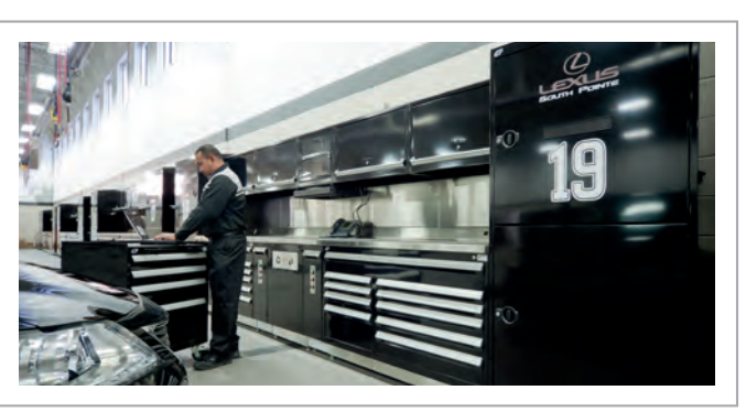
Lexus South Pointe (AB)