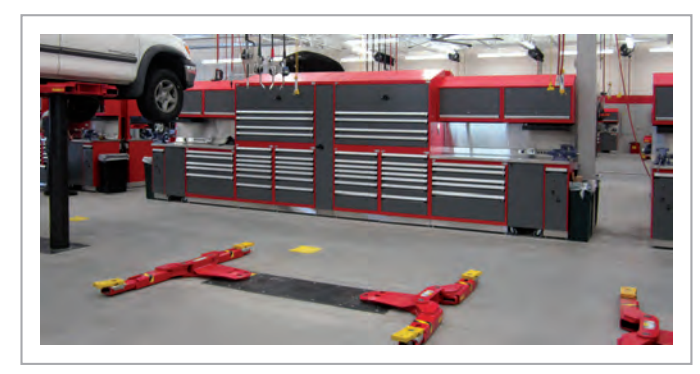
Luther Brookdale Toyota • Scion (MN)