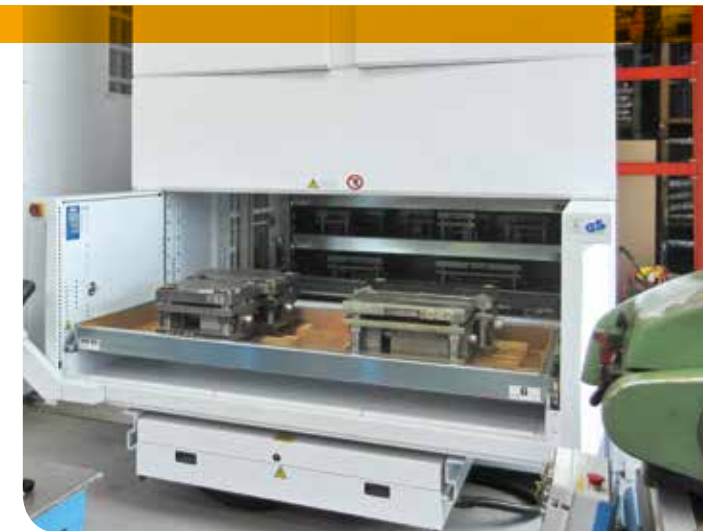
Integration with Modula LIFT

Up to 2,200 lbs across the entire tray range Up to 161.41" wide