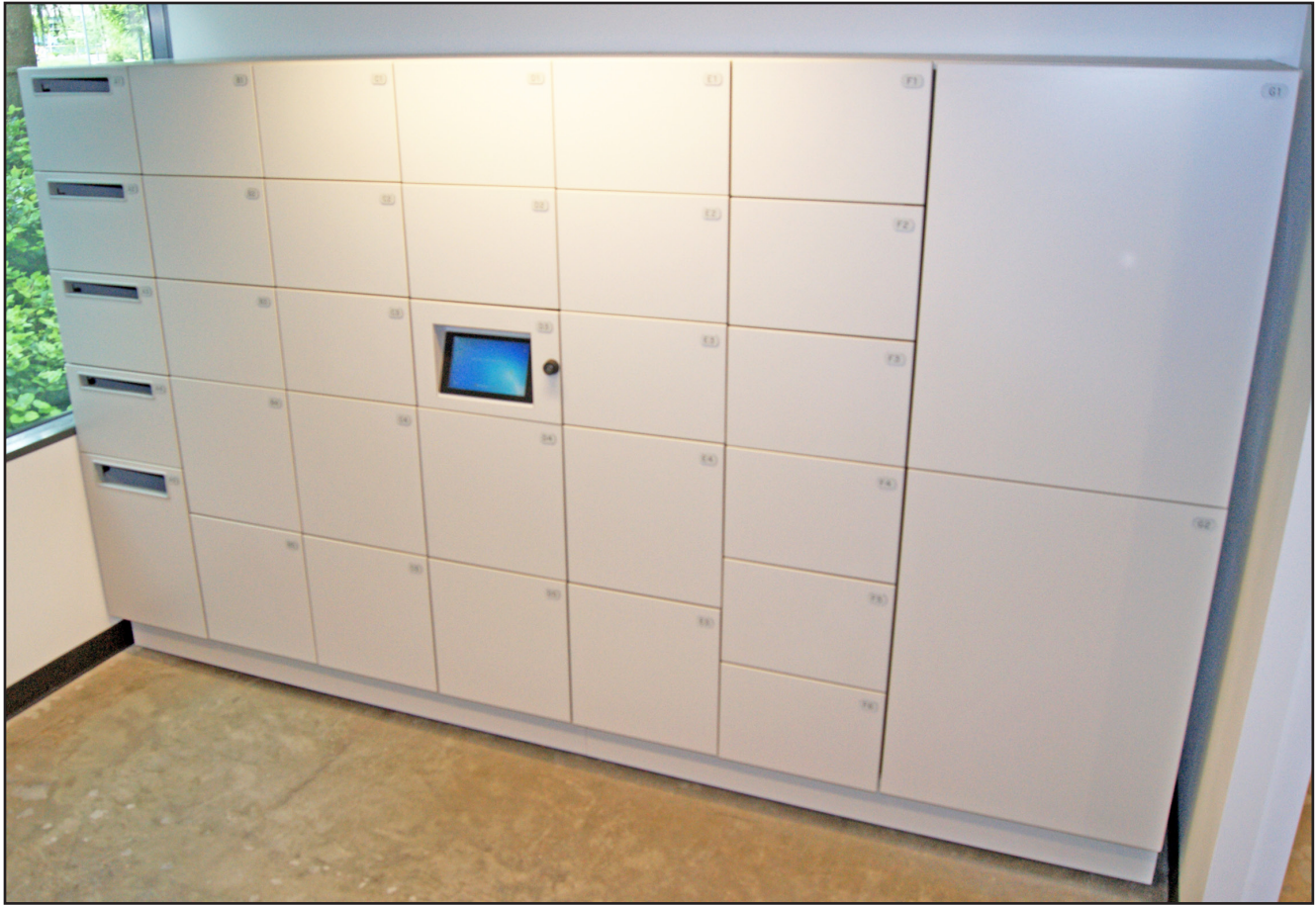
Fits Your Specific Needs and Space

APX was invented to remedy logistical inefficiencies in the distribution and receipt of deliverable assets across your enterprise.