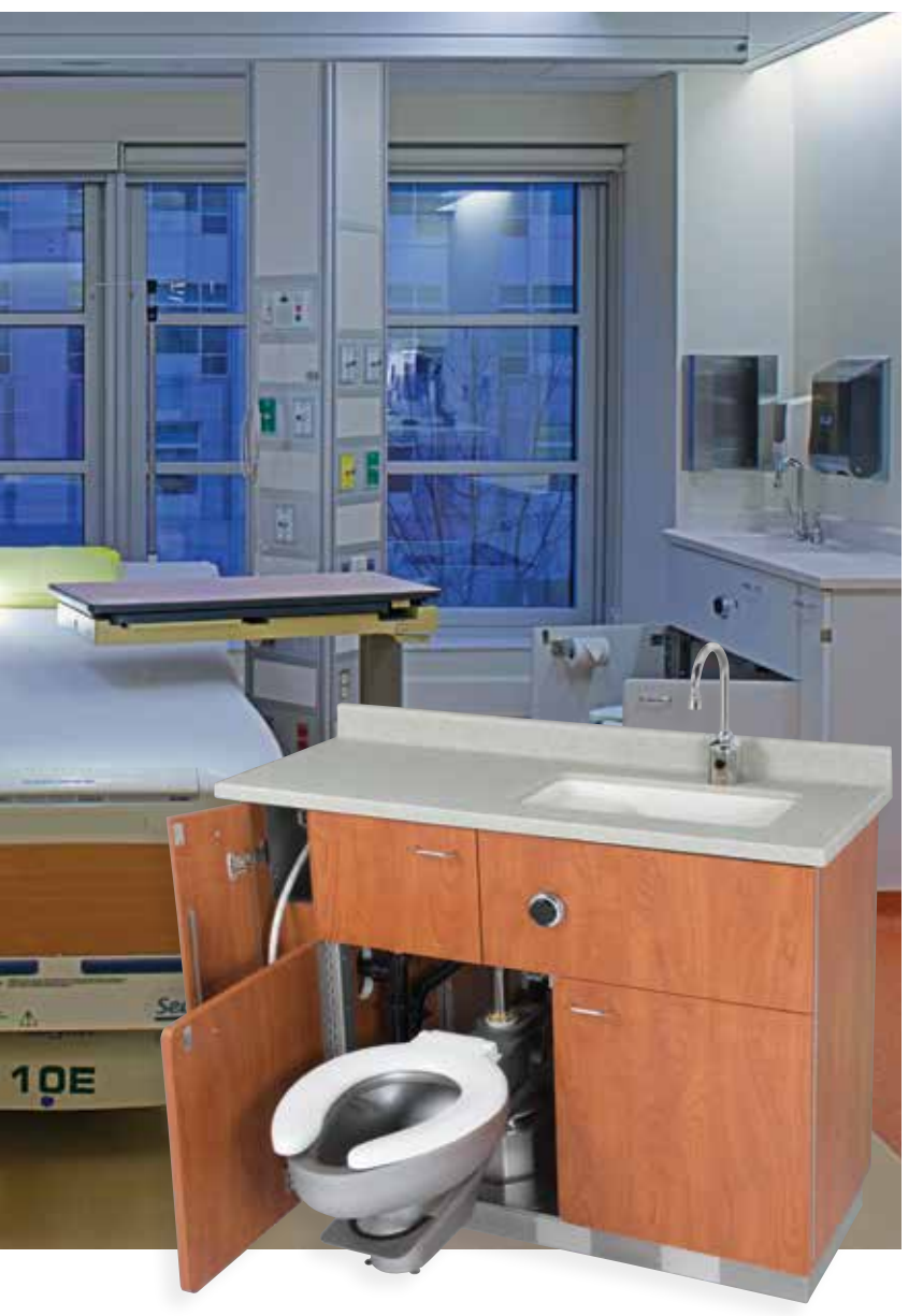
LavCare Combination Units with non-porous Terreon and TerreonRE solid surface countertops.

NEW HS-Series solid surface all-inclusive undermount basins offer the flexibility to specify multi-purpose plumbing fixtures that are aesthetically pleasing and practical. Bradley's SafeCare™ ligature-resistant product line was developed in consultation with behavioral health professionals for restrooms in specialized care situations. Handwashing, wall showers and accessory options are styled to suit patient rooms that are designed to enhance patients' feelings of a familiar, safe home-like environment.