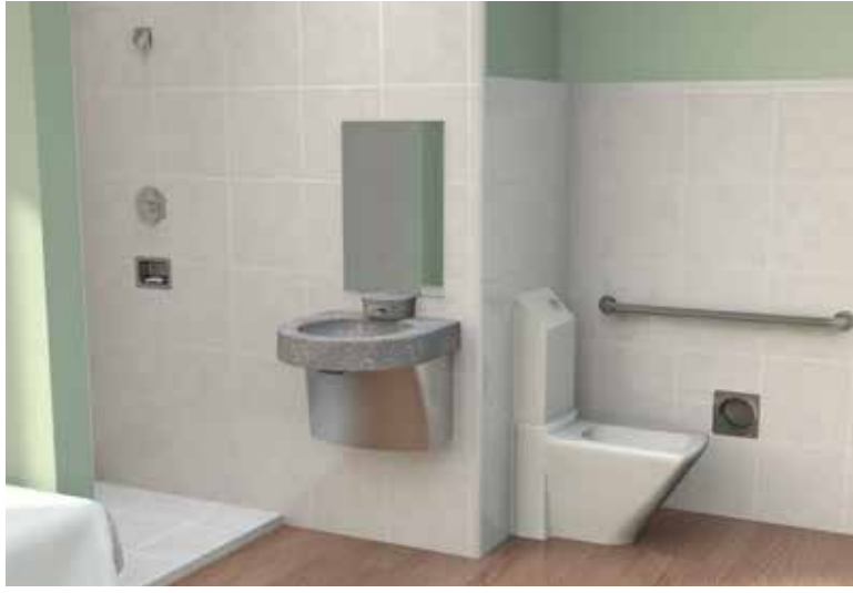
Above right: NEW HS-Series undermount basins are perfect for patient rooms, nursing stations and exam rooms. Lower right: SafeCare ligature-resistant lavatories, wall showers and accessory options., urinals, combi units and showers.