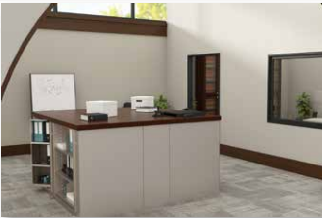
Times-2 Collaborative Counter