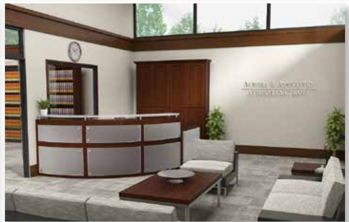
Reception Area Cabinets