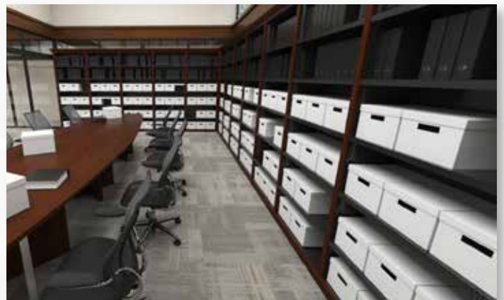
Legal Case Room