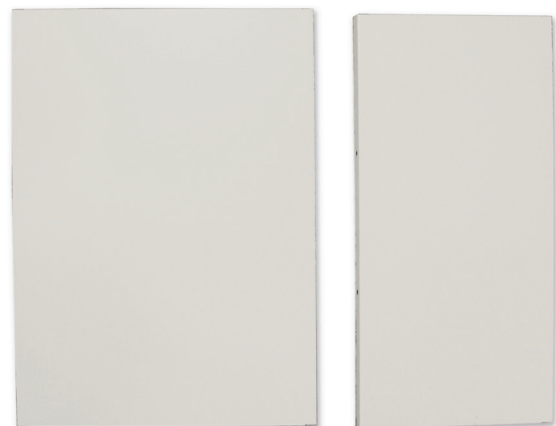
Deck packages come preconfigured in 12" and 18" wide segments based on overall span width.