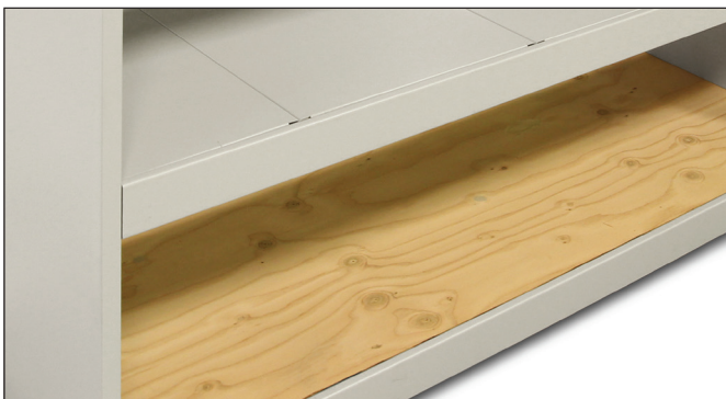
Decking Options include Steel or End User Supplied Plywood