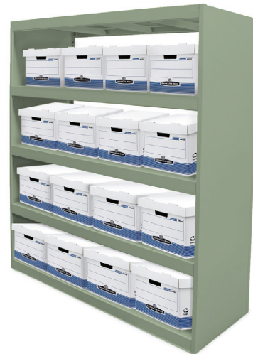
1100 Series Weight Load Capacity Manually and Uniformly Loaded Steel Decking