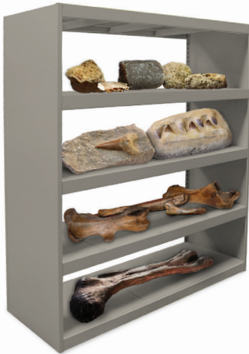
1800 Series Weight Load Capacity Manually and Uniformly Loaded Steel Decking