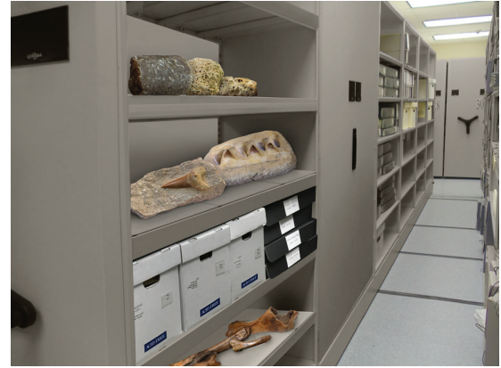
Wide-Lok integrates seamlessly with Aurora Mobile, Shelving, and Collections Cabinets