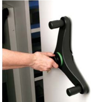
Aisle Safety Lock