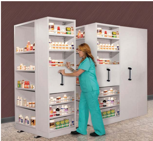
End-Stor™ for quick access applications such as pharmacies.