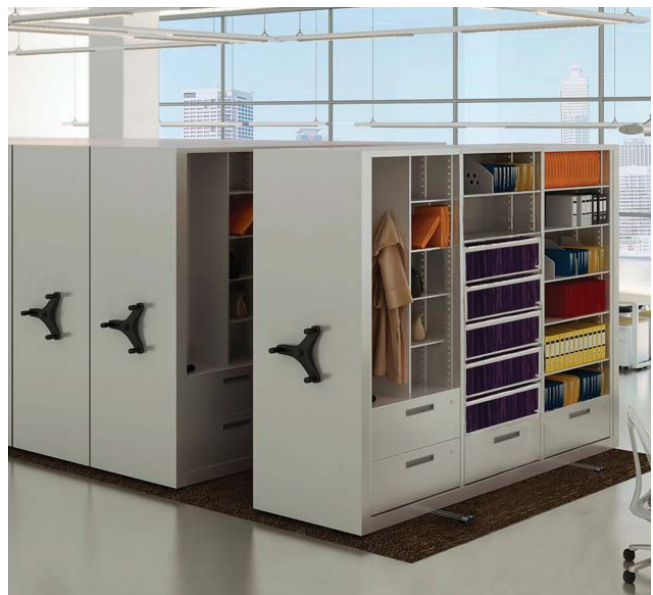
Shared Departmental Storage with Hanging Files