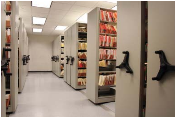
High Density Filing