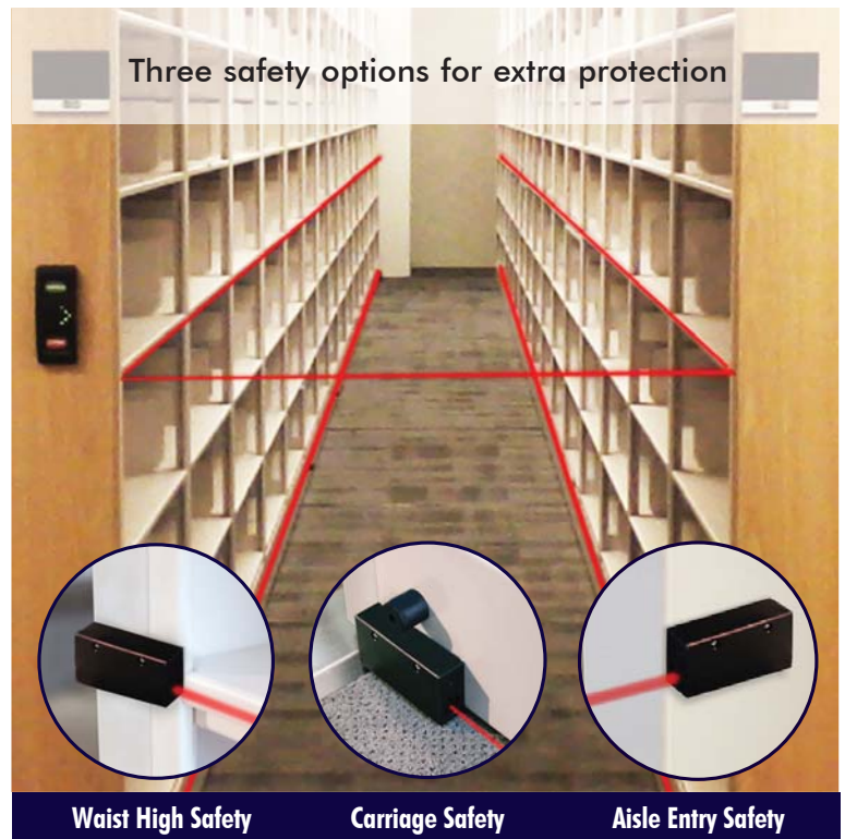
Waist High Safety