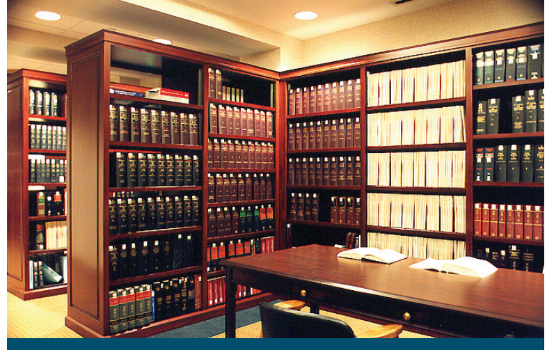
Wood-Tek Law Libraries