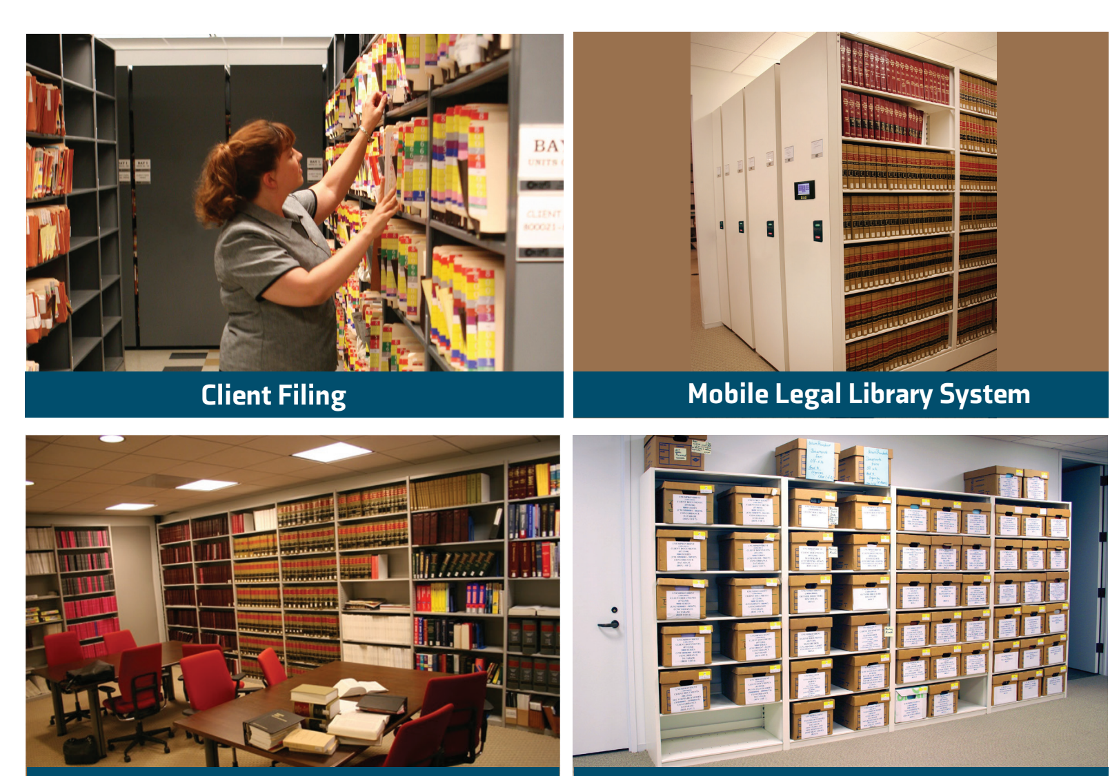
"War Room" Trial Preparation

With aesthetics that fit into any professional law firm or judicial setting, our American made products have proven to be an exceptional investment for our legal customers providing long lasting quality.