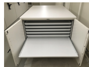
Full Width Pullout Shelves with Extension Slides