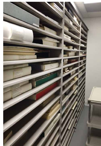
Archival Material on Aurora Shelving