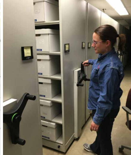
Archival Material on Mobile Carriages