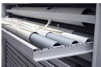
Rolled Textile Drawer