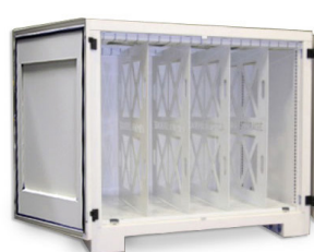
Vertical Art Dividers