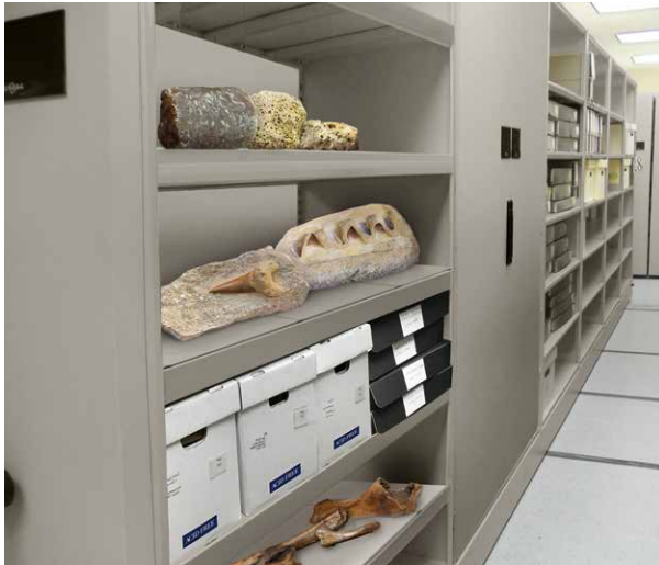
Museum Cabinets and Wide-Lok Shelving on Mobile Carriages

In addition to Museum Collections Cabinets, Aurora has many other storage solutions such as Art-Stor Art Rack, space efficient Aurora Mobile, sturdy Quik-Lok Shelving, Wide-Lok Wide Span Shelving, and Aurora Library Shelving for research centers.