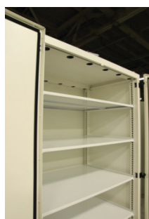
Full Width Adjustable Shelves