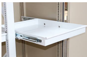
Drawers with Full Extension Slides

* Adjustable on 3/4" increments. Drawer Slide Capacity 200 lbs.