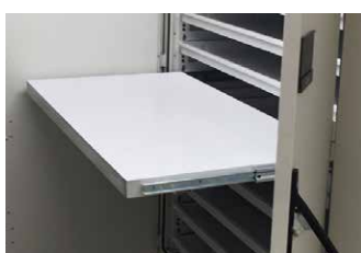
Pullout Work Surface