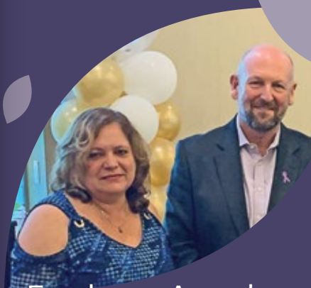
Employee Awards pg. 7