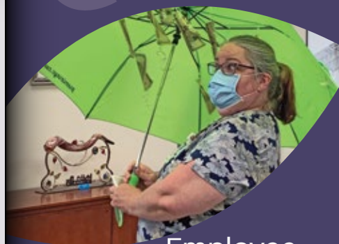
Employee Celebrations pg. 7