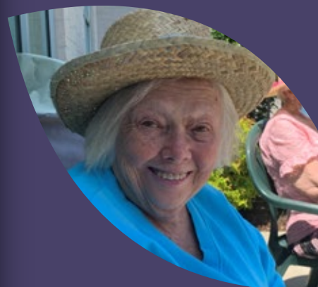
Slice of Life pg. 3