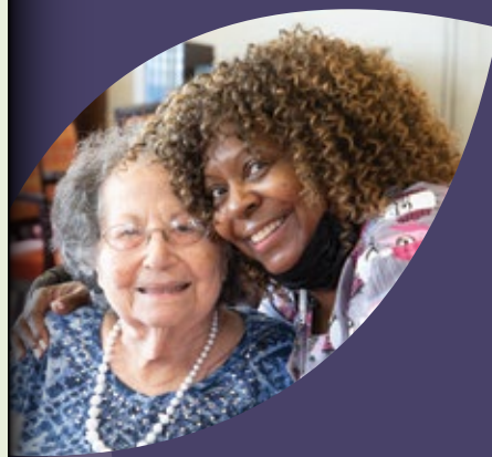
5th Anniversary Celebrations pg. 3