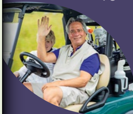
Men's Club pg. 5